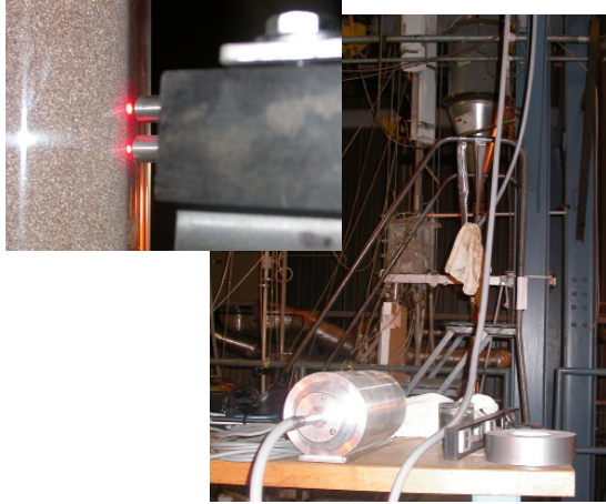
Fig. 3: Labasys® 100 Flex instrument at a pilot plant (right) and tip of the instrument (left).

With the objective to demonstrate the operation a lab scaled test unit was built. This cold flow model was used for scale-up purposes, solids flow control and solids pressure drop tests. Therefore precise insights in the complex solids loops were fundamental.